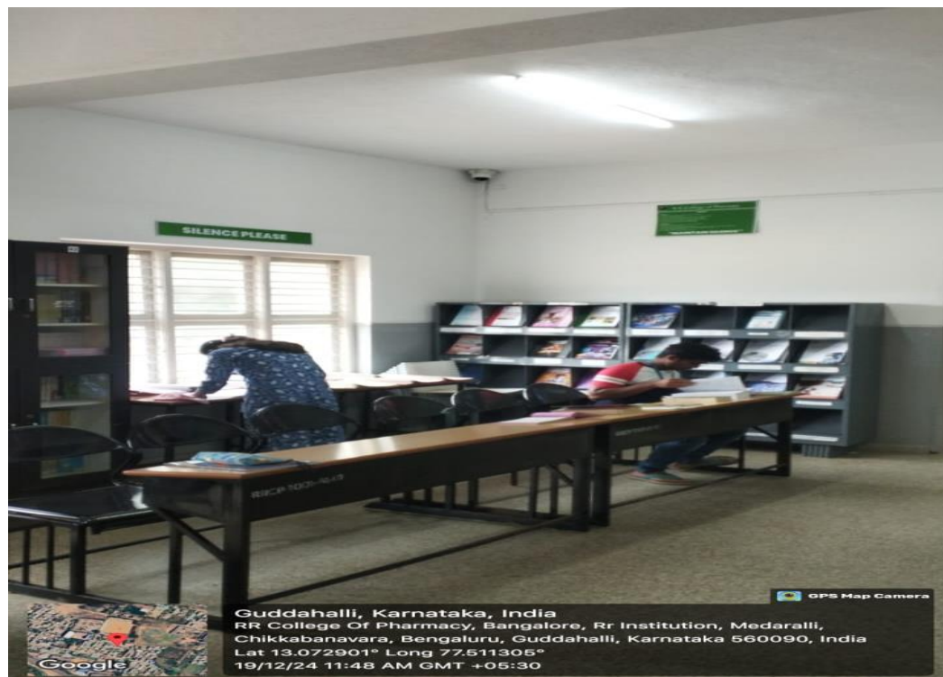
USE OF LED LIGHTS